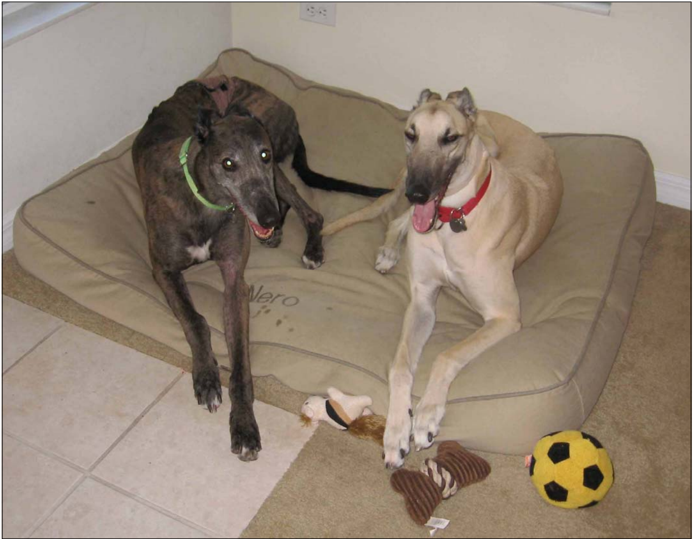
Penske (left) and Nero, in Nero's bed. Penske pretty much took over the bed during his 2 1/2 week stay at our house, but once or twice, they shared it—or Nero had it to himself. While Penske was the dominant dog in this relationship, he was never aggressive toward Nero, or us. And he never played with Nero's toys.